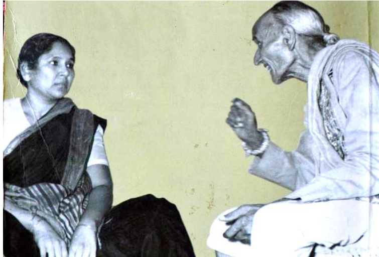
Figure 2 : Vedantam Laxmniarayana Shastri teaching Abhinaya to T Balasaraswati, 1947~48